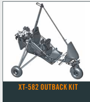
XT-582 OUTBACK KIT