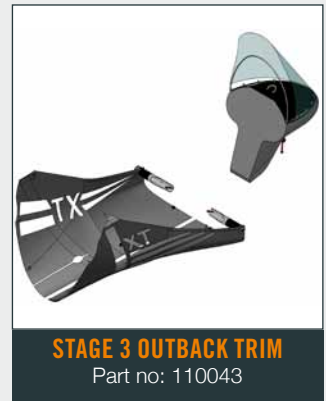
STAGE 3 OUTBACK TRIM