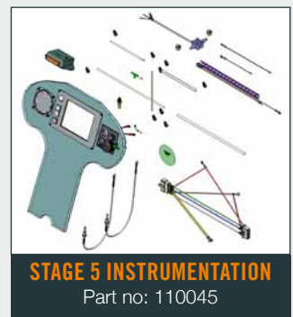
STAGE 5 INSTRUMENTATION