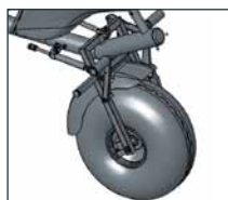
Clear assembly drawings